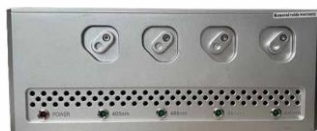
Laser power supply front panel