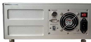
Laser power supply rear panel